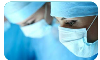
A revolutionary new way to fight viruses